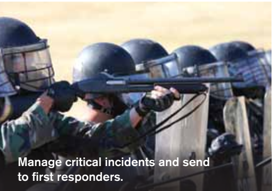
Manage critical incidents and send to first responders.